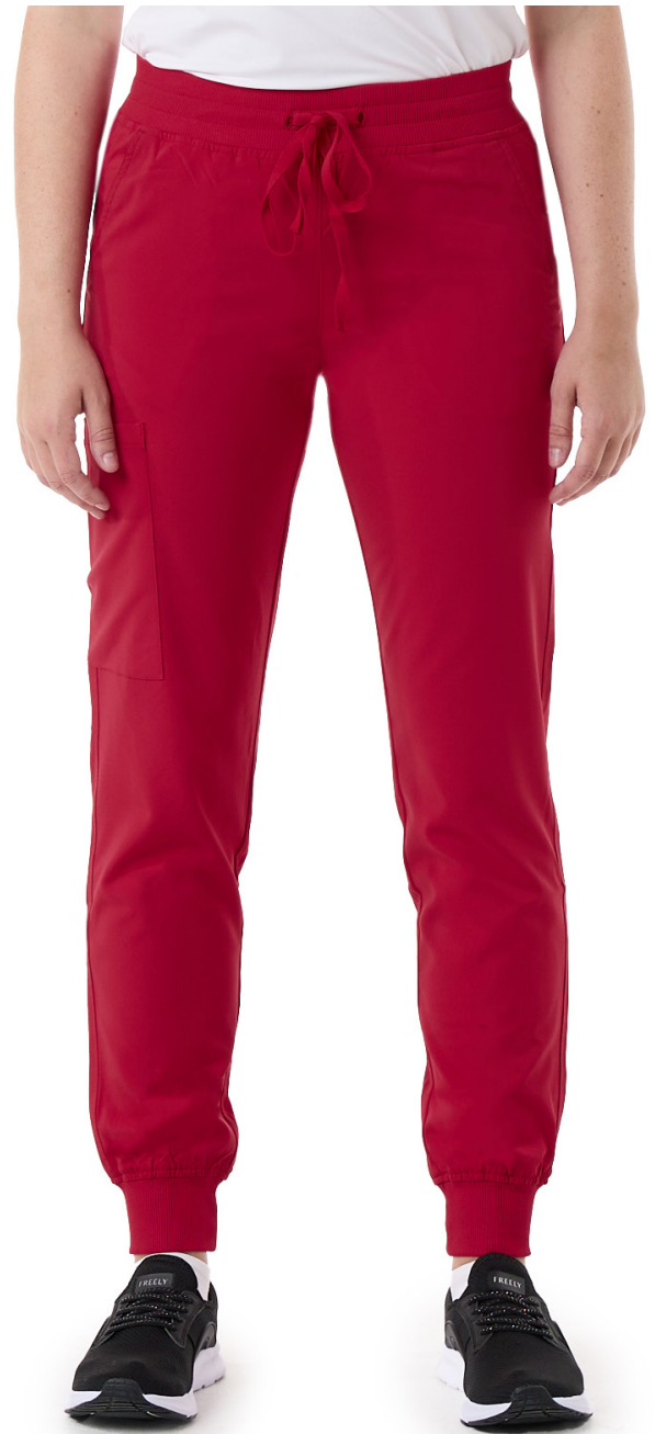
Color shown: Red