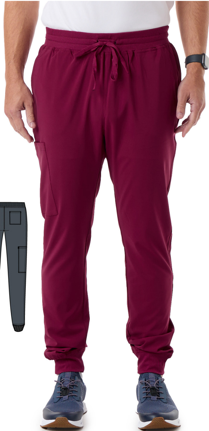
Color shown: Wine